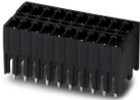
The figure shows a 10-pos. version with 20 contacts

Please be informed that the data shown in this PDF Document is generated from our Online Catalog. Please find the complete data in the user's documentation. Our General Terms of Use for Downloads are valid ( http://phoenixcontact.com/download )